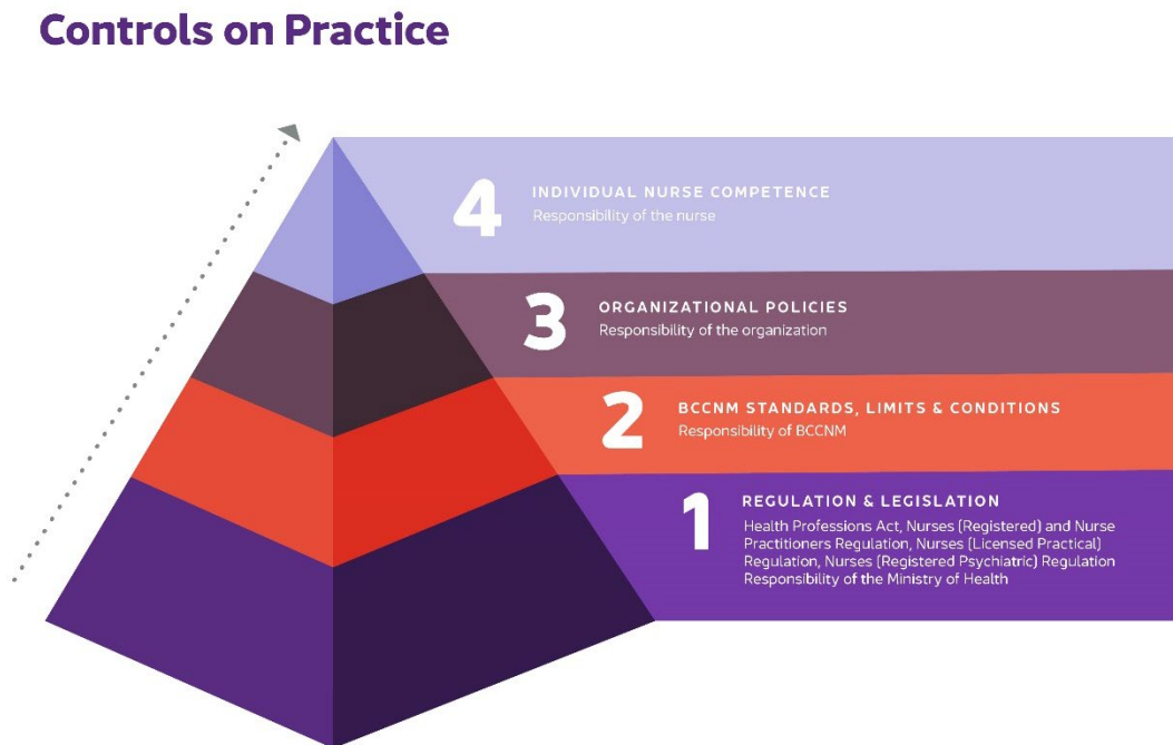
Figure 2. Controls on practice

The Professional role competencies link to assessing and maintaining individual competence necessary for practising within the controls on practice. The ability of individual entry-level registered